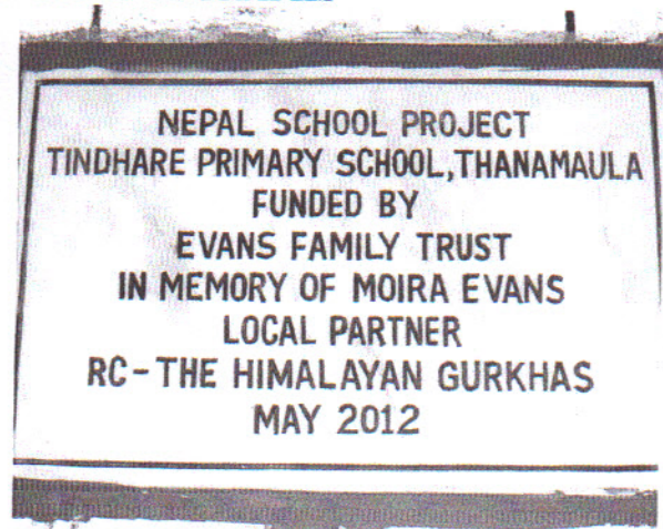
"writing on the wall"