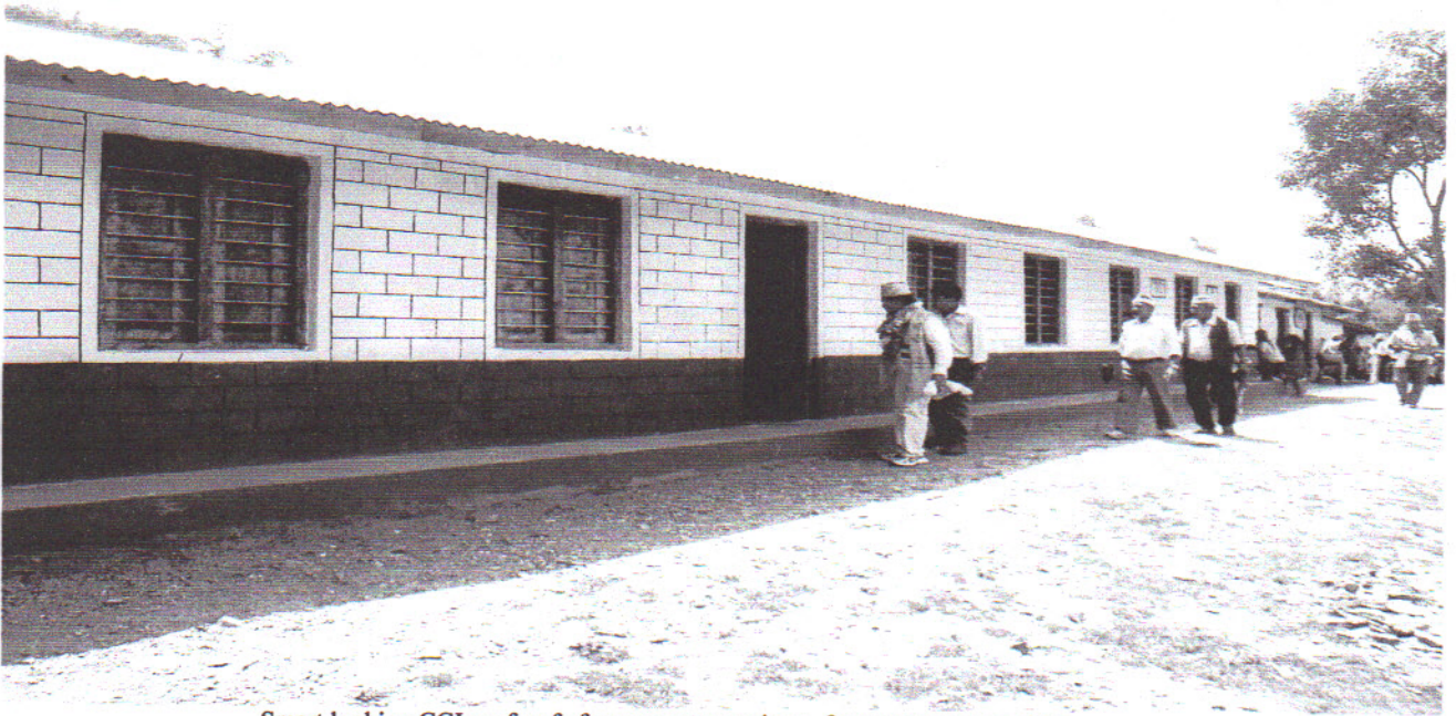
Smart looking CGI roof, safe from monsoon rain or from extreme sun shine.