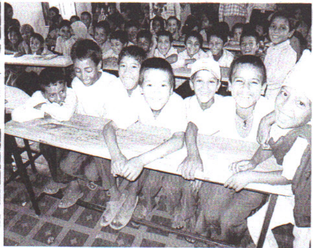
Happy children safe from the elements