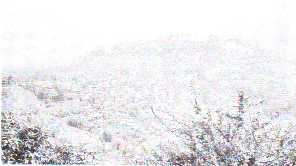
Typical Nepali hill village from where children commute to Limithana Tindhare school