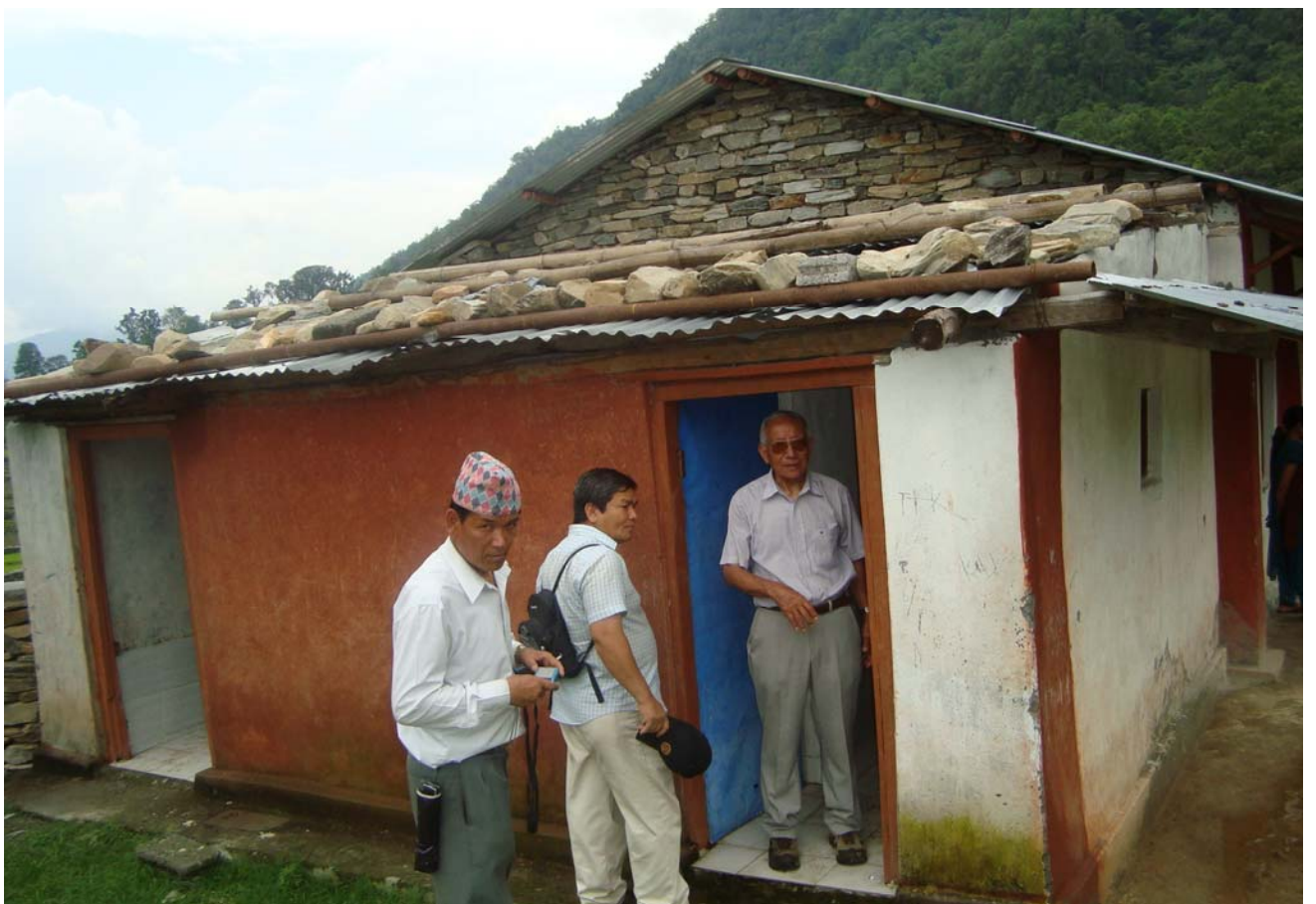
Rtns examine toilets