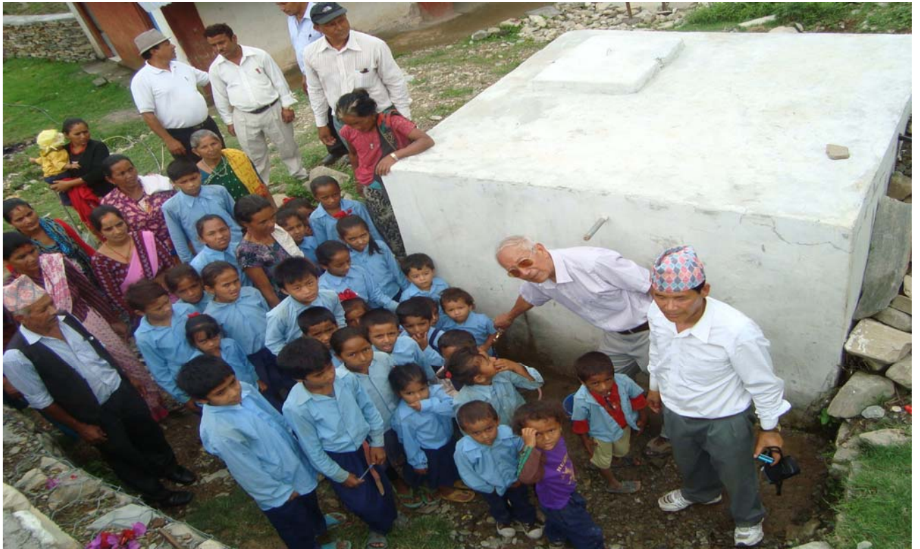
Rtns with children and the teachers