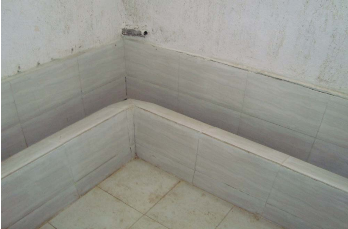
Urinal for boys