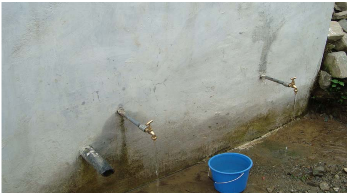
Water taps attached to the storage tank