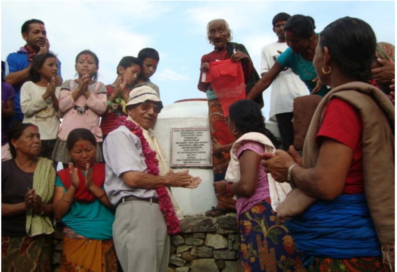
The 92 years old lady (one of the beneficiaries) does the honour by unveiling EIFION TRUST marble.