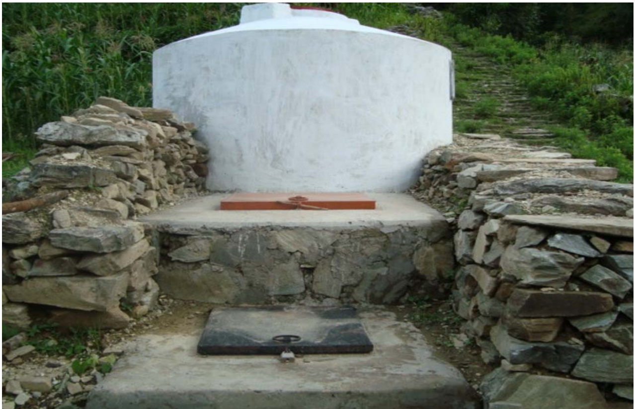
Water storage tank with capacity of 10,000 Litres