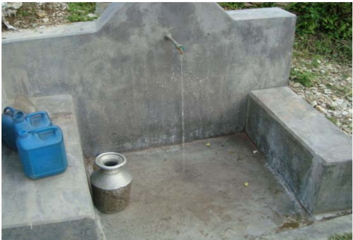
One of the water taps in centrally positioned locations in Anpu.