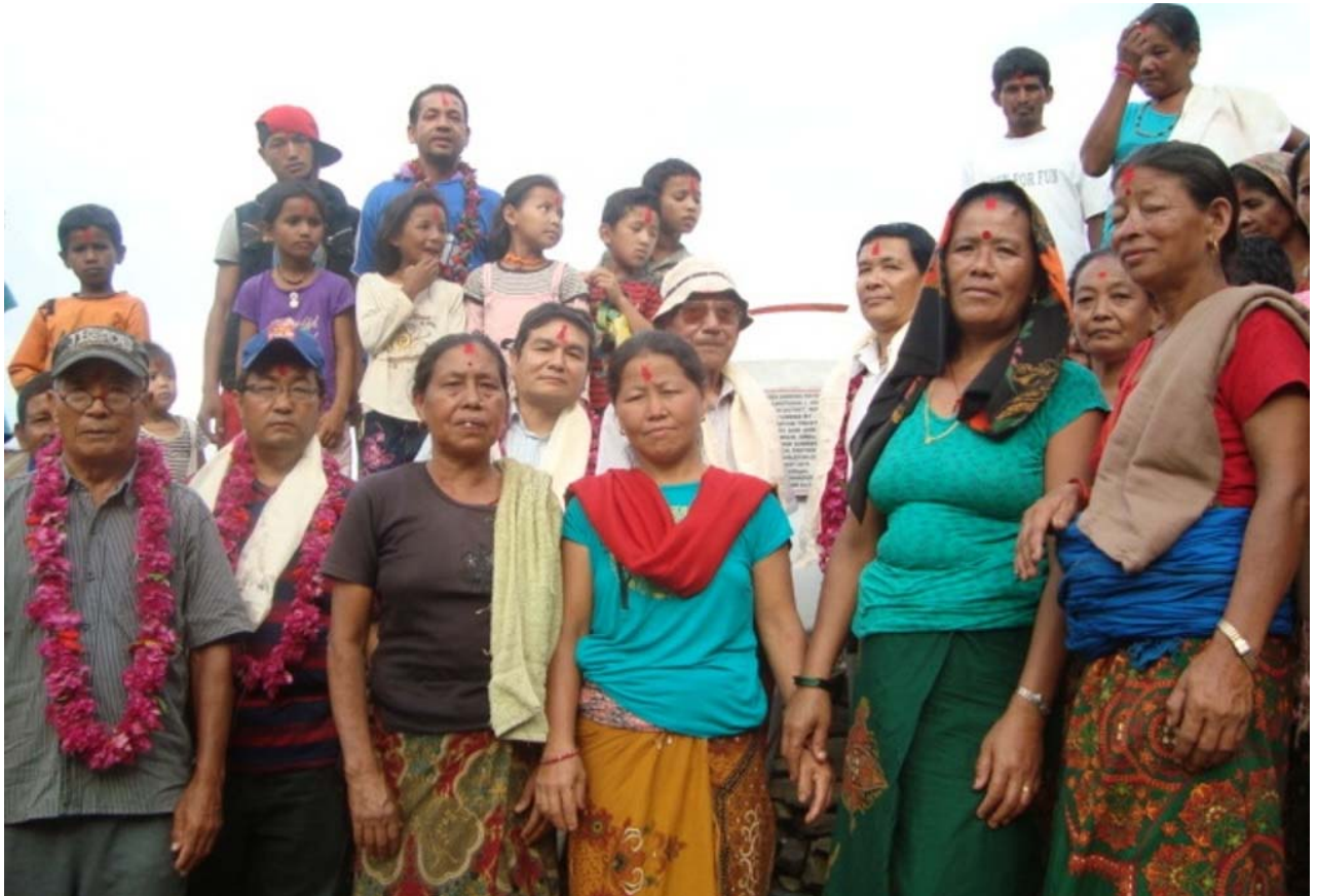
Rtns with the locals in front of water storage tank (in the back ground)